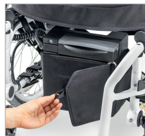
New battery bag style with straps on pack helps ensure stability and strength