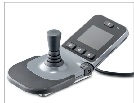
Display - Intuitive and user-friendly color display. Can be individually programmed to meet your driving characteristics.