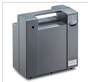
New discreet black battery color