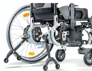
Anti-Tippers with Jack-Up Function