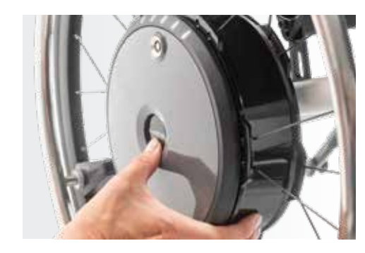
Quick and easy: The e-motion wheels can be attached and removed in no time at all using the quick-release mechanism.

Whether at work, shopping or in leisure time: the e-motion is extremely manoeuvrable and is as easy to move as a manual wheelchair in any situation. The e-motion wheels can be removed from the wheelchair in a single movement and loaded into any boot. The manual wheels can usually still be used with the same wheelchair. The e-motion is always with you when you're travelling, and you can even take it on board a plane.