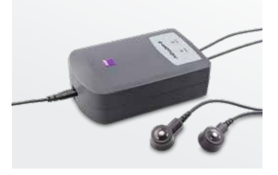
batteries in a few hours (included in the scope of