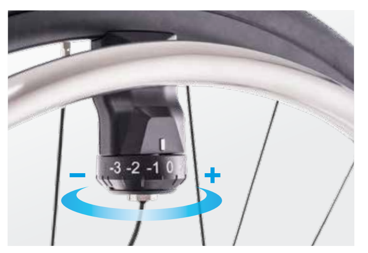
Sensitivity of the push rim sensors adjustable in seven steps

The e-motion is flexible: it is compatible with a wide variety of wheelchair models and can be adapted to your individual needs. The sensitivity of the push rim sensor can be adjusted independently on both drive wheels. So more or less strength in one arm is not a problem. Your specialist dealer or therapist also has the option to carry out further adjustments to your e-motion so that it is optimally adapted to your needs and driving style. The e-motion is available in three wheel sizes and can be equipped with ergonomic push rims on request. This ensures optimum grip in every driving situation.