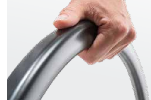
Curve-L push rim: ergonomic hand position and Automatic battery charger: Automatically adapts optimised power transmission for people with good to the mains voltage and charges both e-motion hand function (accessory)