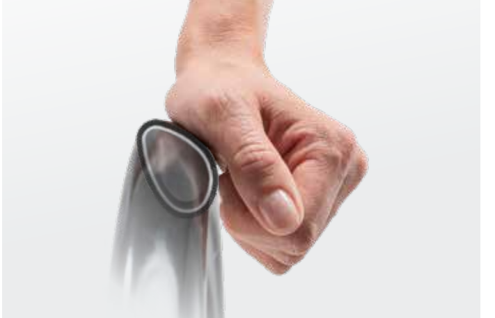
Coated Quadro push rim: control and power transmission also with limited hand function