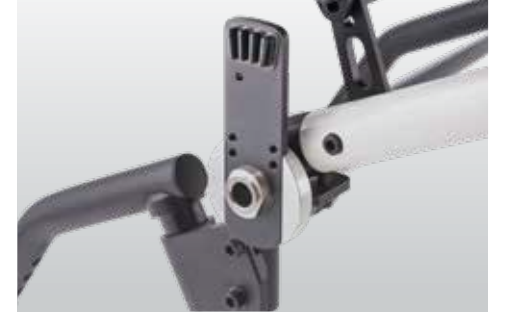
Light and discreet: the pre-assembled bracket on the wheelchair for docking the e-motion wheels