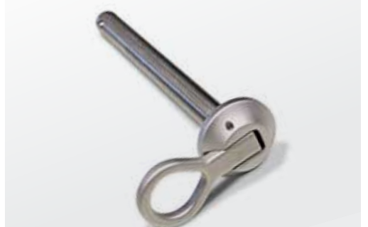
Ergonomic stub axle: Facilitates unlocking and removing the e-motion wheels from the wheelchair