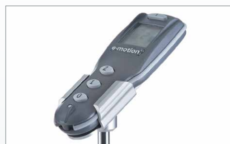
Ergonomic Control System [ECS]