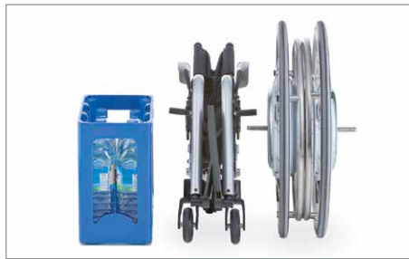
Easy to dismantle, easy to transport