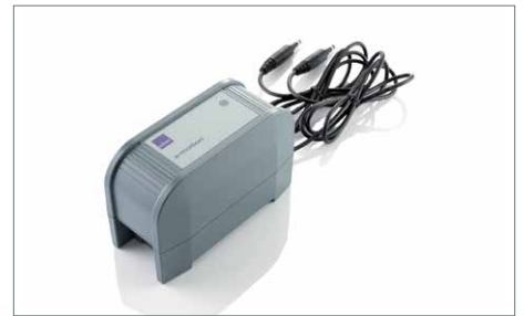
Automatic battery charger