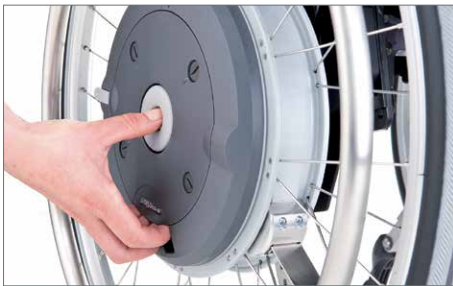
Removing the e-motion wheel from the wheelchair