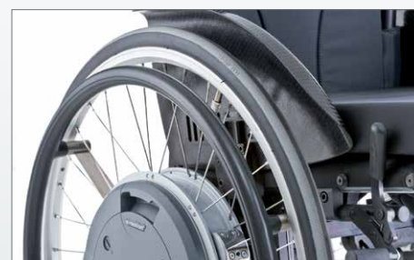
Rubber-coated push rims for improved grip