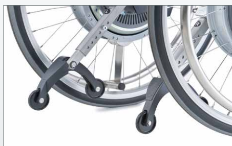
Anti-tippers with jack-up function for easy removal of the wheel